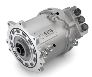
HV Traction Machine