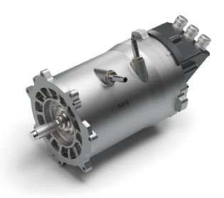
HV Traction Machine