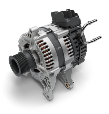
Boost Recuperation Machine