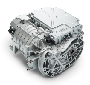
HV 3-in-1 EDS